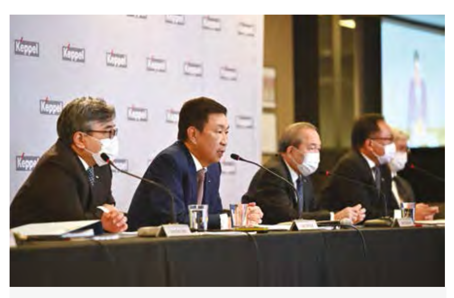
Keppel Corporation's senior management engaged the media and investment community at the 2H & FY 2020 results webcast.

Others comprise the rest of the world, as well as unidentified holdings and holdings below the analysis threshold as at 10 February 2021.