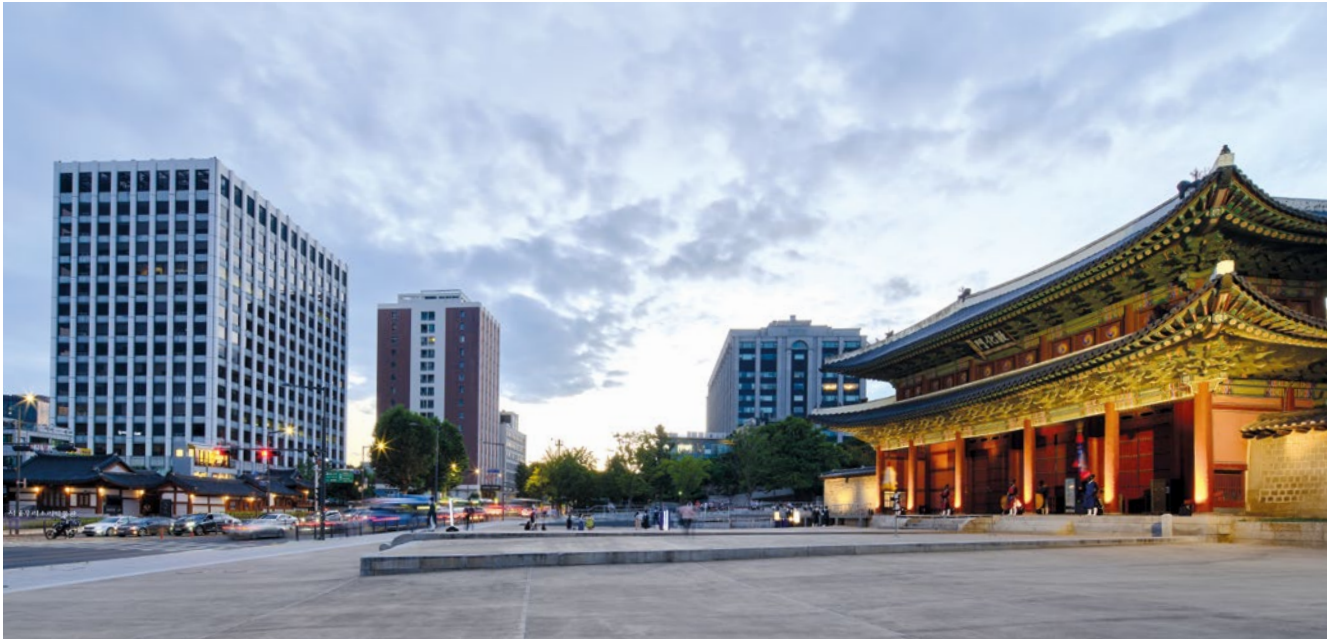
The joint investment of Samhwan Building (left) in Seoul by Keppel Land and Keppel Asia Macro Trends Fund IV and KB Bank Discretionary Fund managed by Keppel Capital is a prime example of the Group's ability to harness complementary strengths and tap third-party funds for growth.