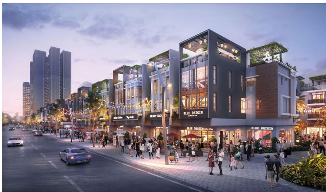
Keppel Land has built a strong and diverse track record in Vietnam, winning several industry-leading awards and drawing good buyer demand for its developments. (In picture: Celesta Avenue in Ho Chi Minh City, was named the Best Housing Development at PropertyGuru Vietnam Property Awards.)

Keppel Land deploys its in-house design capability to formulate suitable configurations or services and harnesses digital technologies to develop smart platforms that can enhance user experience as well as reduce an asset's carbon footprint.