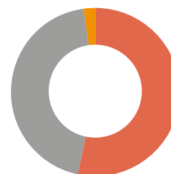
TOTAL ASSET DISTRIBUTION BY SEGMENT (%) as at 31 December 2019