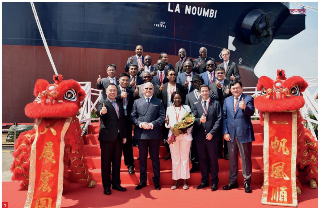
1 Senior management from Keppel O&M and Perenco Group, together with government officials from Republic of the Congo, celebrated the naming of FPSO La Noumbi, Keppel's sixth project for Perenco and the fifth for the Republic of the Congo.